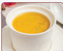
603 杨枝甘露 Mango Purée with Sago $5.80