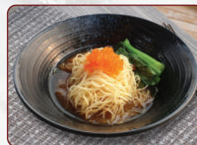
302 鲜虾子捞面 Hong Kong Noodle with Shrimp Roe $7.80