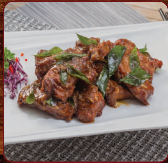
407 蒙古猪肉 Mongolian Pepper Pork $15.80