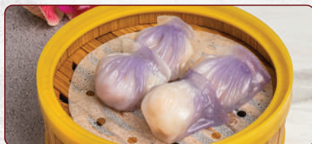
505 胶原蛋白虾饺 Collegen Shrimp Dumpling "Har Kao" $8.20