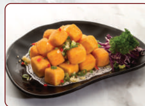
211 椒盐黄金豆腐 Crispy Golden Tofu with Chef's Seasoning $12.80