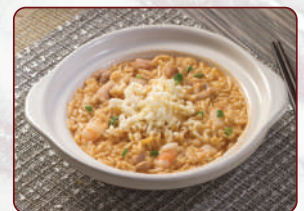
303 浓虾汤泡饭 Poached Rice with Prawn Broth $16.80