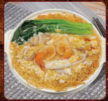
412 海鲜滑蛋生面 Crispy Noodles with Seafood Egg Sauce $16.80