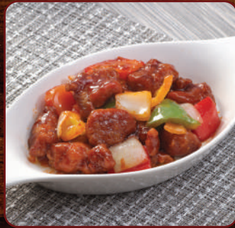
406 糖醋梅花肉 Sweet & Sour Pork $15.80