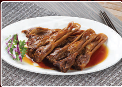
109 卤水伦敦鸭舌 Braised London Duck Tongue $7.80