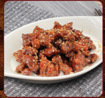
404 蜜汁妈蜜鸡 Marmite Chicken $15.80