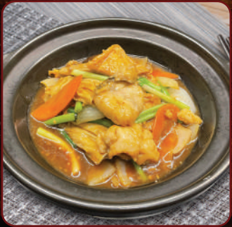
405 红焖班片煲 Claypot Braised Garoupa in Brown Sauce $25.80