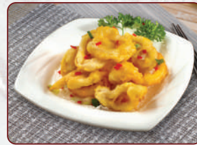
205 蒜香脆铃铃 Crispy Calamari and Onion Ring with Garlic Seasoning $10.80