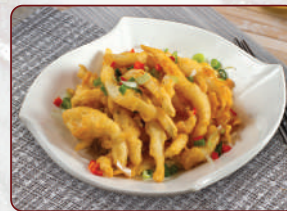
208 椒盐白饭鱼 Battered Whitebait $9.80