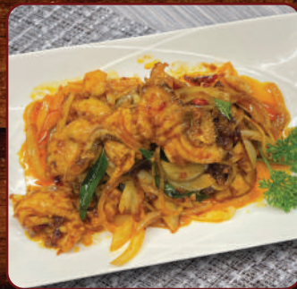
411 咸香甘香班片 Kam Hiong Garoupa Fillet $22.80