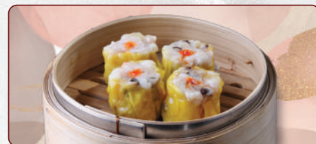
506 港式烧卖 Steamed Siew Mai $8.20