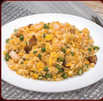
401 招牌炒饭 Signature Fried Rice $13.80