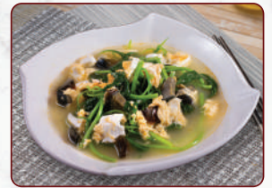
206 三蛋黄苋菜 Spinach with Eggs in Superior Stock $13.80