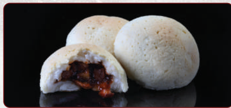
502 原味伦敦鸭肉雪山包 Crispy London Duck Snow Bun (min. 2 pcs) $3.20 🍷