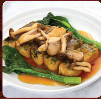
402 自制菠菜豆腐 Homemade Spinach Tofu $16.80