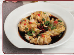
202 红油抄手 Shrimp Dumpling with Aged Vinegar Sauce $8.80