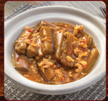
408 鱼香茄子煲 Claypot Braised Brinjal with Minced Pork $14.80