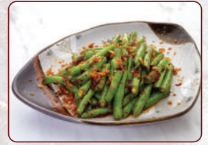
203 虾米酱四季豆 Stir-Fried Long Bean with Dried Shrimp $13.80