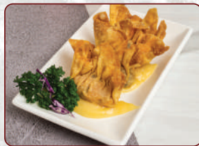
207 脆皮炸水饺 Crispy Shrimp Dumpling with Yuzu Mayo $8.80