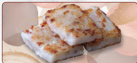
504 腊味萝卜糕 Pan-Fried Radish Cake $6.80