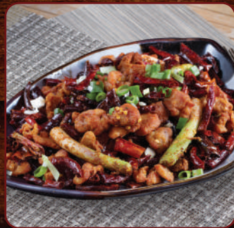
410 川味辣子鸡 Sichuan Spicy Crispy Chicken $16.80 🐦