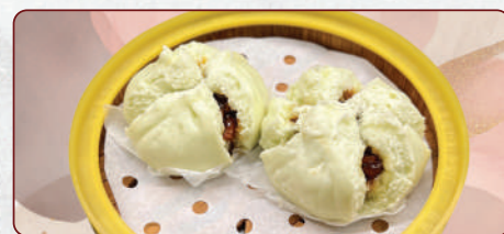
509 伦敦鸭肉干包 London Duck Bak Kwa Pandan Pau $7.80