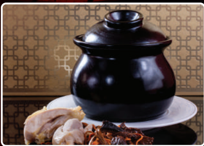
110 时日炖汤 Double Boiled Soup of the Day $7.80