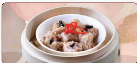
507 豉汁蒸排骨 Steamed Pork Ribs with Black Bean Sauce $6.80