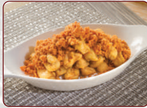
204 肉松脆茄子 Battered Brinjal with Homemade Pork Floss $10.80