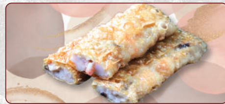
503 鲜虾付皮卷 Shrimp in Beancurd Skin Fritter $7.50