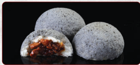
501 首创黑椒伦敦鸭包 Signature Black Pepper London Duck Bun (min. 2 pcs) $3.20 🍷