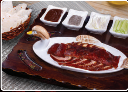
107 伦敦北京鸭 London Peking Duck $53.80