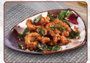
209 奇味五香炸肉 Deep-Fried Shirobuta Pork Loin $14.80