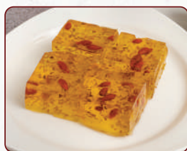
601 杞子桂花糕 Chilled Osmanthus Jelly with Wolfberries $6.80