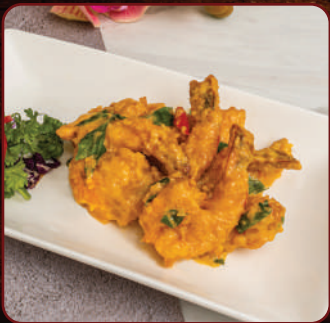
409 金沙奶油虾 Tiger Prawn with Golden Salted Egg Sauce $20.80