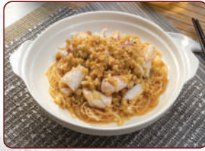
201 蒜香牛油鲜鱿 Stir-Fried Squid with Garlic Butter $17.80