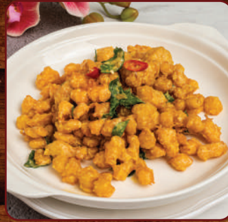
403 黄金玉米炒虾粒 Signature Crispy Corn & Prawn with Salted Egg $16.80 🐦