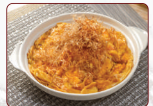
212 日式海鲜煎蛋 Okonomiyaki Seafood Omelette $13.80