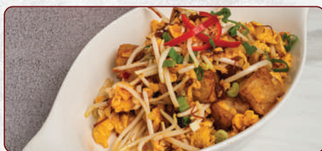
508 XO酱炒萝卜糕 XO Radish Cake $13.80