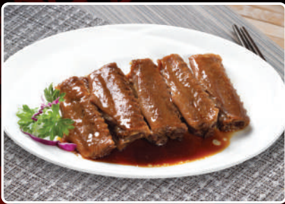
108 卤水伦敦鸭翼 Braised London Duck Wing $7.80